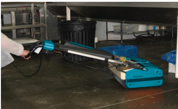
Cleans under fixed racking and low production equipment