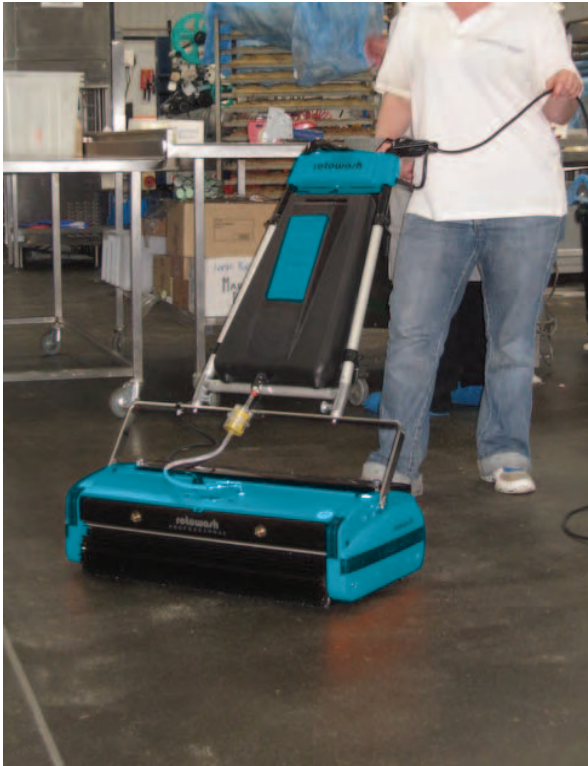
Cleans anti-slip resin, improving safety and hygiene