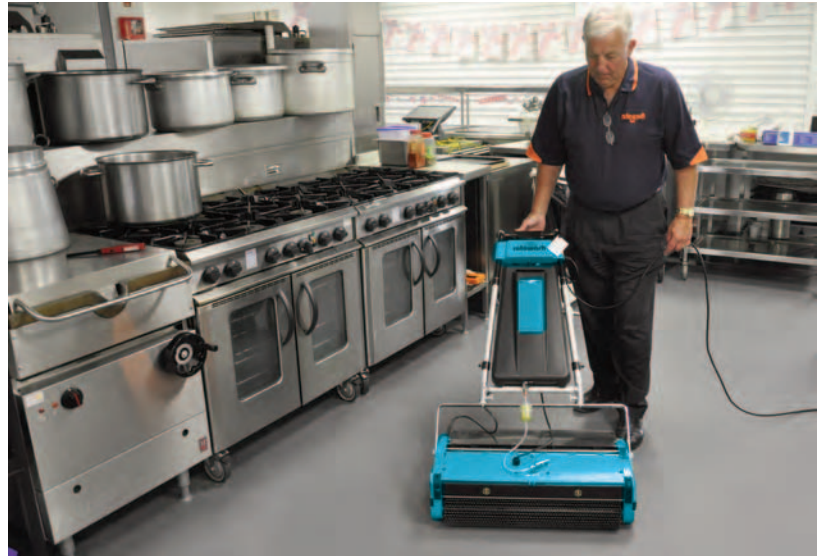
Flexible - Easily cleans food preparation areas