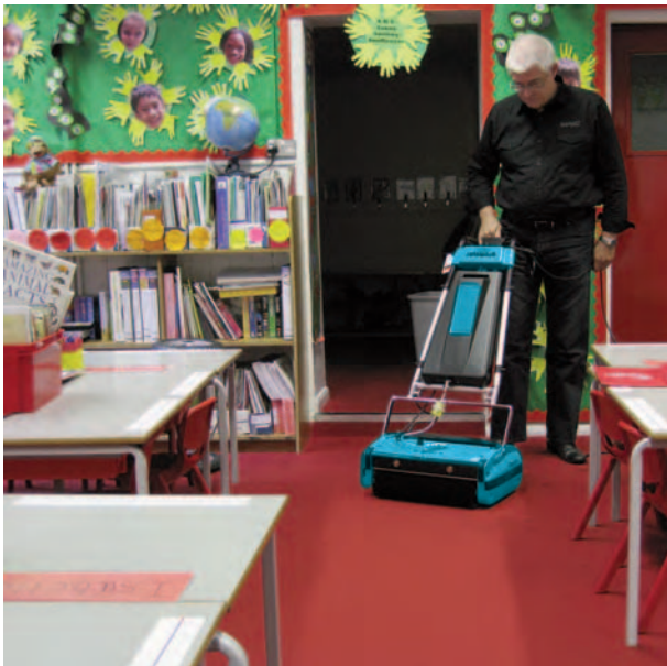
Manoeuvrable - Easily cleans confined areas such as class rooms