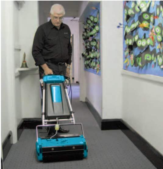
Fast - Easily cleans large areas such as corridors